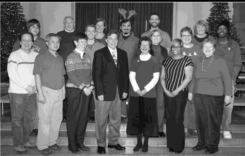
Merry Christmas and Happy New Year from the Staff of Church of the Saviour

THE CHIMES (USPS 0463-810) is published bi-weekly by Church of the Saviour (United Methodist), 2537 Lee Road, Cleveland, OH 44118-4198. Periodicals postage paid at Cleveland, OH. POSTMASTER: Send address changes to THE CHIMES, Church of the Saviour, 2537 Lee Rd., Cleveland, OH 44118-4198.